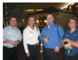
Midtown Holiday Inn and