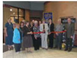
Grand Island Little Theatre invited the Connectors to a ribbon cutting on April 15, 2010 to celebrate the completion of their theatre addition.