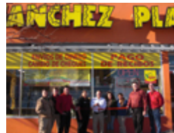
Sanchez Plaza Restaurant & Bakery invited the Connectors to a ribbon cutting on November 5, 2010 to celebrate their new Chamber partnership.