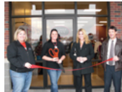
Closet Savvy invited the Connectors to a ribbon cutting on November 12, 2010 to celebrate their new Chamber partnership.