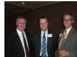
Viaero Wireless Business After Hours, November 11, 2010.