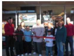
Maximus Car Audio & Rims celebrated their new Chamber partnership with a ribbon cutting on November 5, 2010.

As Grand Island advances our competitive position as an aggressive business, manufacturing, medical services, and destination city, the elevation and enhancement of our collective marketing efforts must be maximized in order to secure trade shows and events. For Grand Island, this could very well become the 'new normal' and the way to realize our full potential.