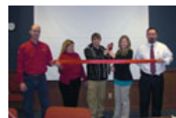
TE Productions celebrated their new Chamber partnership with a ribbon cutting on December 10, 2010.