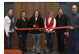
Pretty Pies & Pastries celebrated their new