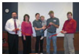
Electrical Unlimited held a ribbon cutting on December 10, 2010 to celebrate their new Chamber partnership.