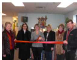
The Teacher's Lounge invited the Connectors to a ribbon cutting on December 17, 2010 to celebrate their new