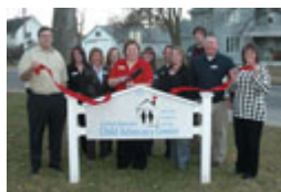
Central Nebraska Child Advocacy Center invited the Connectors to a ribbon cutting on December 9, 2010 to celebrate their recent rebranding.

We must continue to challenge ourselves to anticipate, and be ready when possibilities are presented and to create our own opportunities. By doing so, Grand Island's future success will be guaranteed.