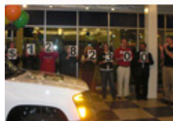
At the Business After Hours, United Way agency directors revealed the total amount raised for