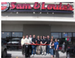
Sam & Louie's invited the Connectors to a ribbon cutting on May 6, 2011 to celebrate their opening and new Chamber partnership.

While these examples are simply illustrations of possibilities, they do cause one to realize that increased Internet-based education, further erosion of employee soft skills, and the reduction of face to face conferences and Summits might become our new reality. See you in IT class.