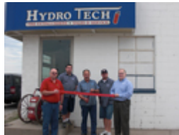
Hydro Tech celebrated their new Chamber partnership with a ribbon cutting.