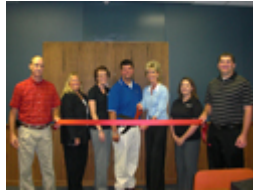
Make-A-Wish held a ribbon cutting to celebrate their new Chamber partnership.