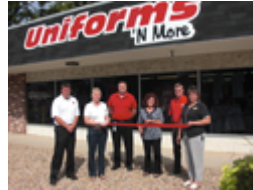
Uniforms 'N More invited the Connectors to a ribbon cutting in celebration of their new Chamber partnership.