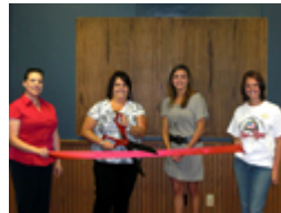
Fresh Concepts had a ribbon cutting to celebrate their new Chamber partnership.